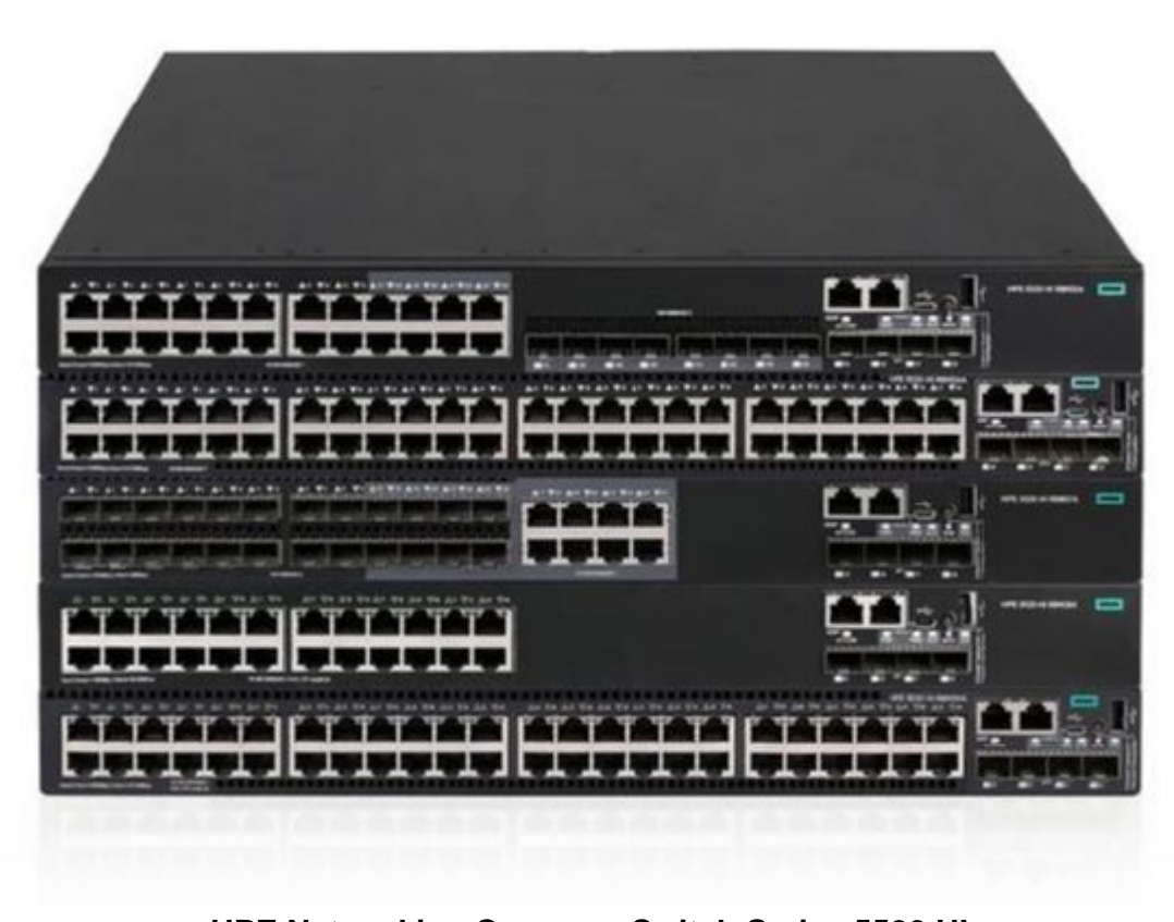
HPE Networking Comware Switch Series 5520 HI

These switches deliver faster performance and advanced L3 features with support for larger ARP/MAC tables and Longest Prefix Match (LPM). VXLAN and EVPN enable multitenant isolation and greater scalability; high availability and resiliency provided by Distributed Resilient Network Interconnect (DRNI), Intelligent Resilient Framework (IRF), Virtual Router Redundancy Protocol (VRRP), Equal-Cost Multipath (ECMP) and Bi-directional Forwarding Detection (BFD). Real-time network health, network and switch performance and visibility provided with Intelligent Management Center (IMC) and Intelligent Network Quality Analyzer (iNQA). Support for IPv4/IPv6, OpenFlow, and MPLS/VPLS features provides investment protection and eases transition from IPv4 to IPv6 networks.